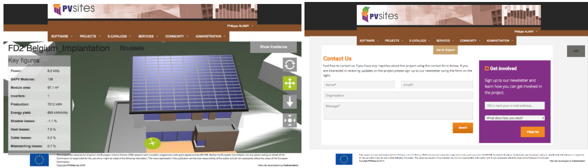
Figure 2- Projects publication on line - Ask for support form

In addition, PVSITES BIM objects have been designed and embedded within the simulation software. A pre-commercial version of PVSITES eCatalog is open to public use as a BIPV Product Information Manager (PIM) through web access. The PIM aims at configuring virtual BIM objects considering the real technical characteristics (geometrical, electrical, thermal, optical) to be used as input to the simulation and calculation models.