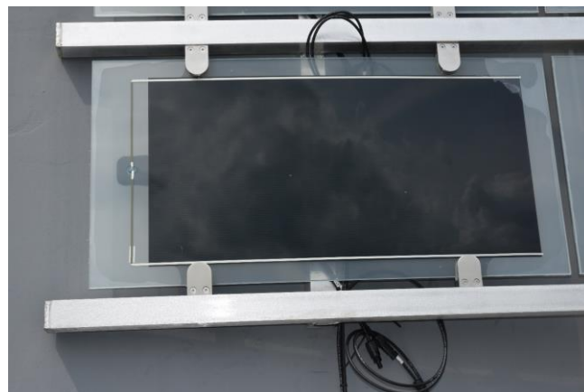
Figure 4.3 P5, curved glass module mounted in test bench at INES, France