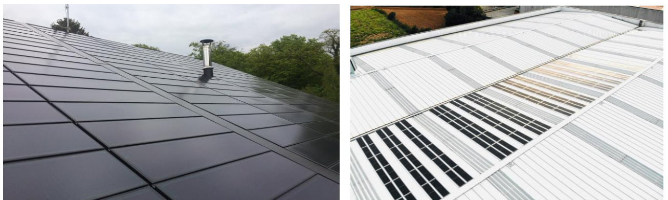
Figure 4.1 P1 mounted on the roof in Belgium (left) and P3 mounted in Spain on CRICURSA building (right)

In this section pictures of the 5 products are shown to illustrate how they are mounted. Detail on the products can be found in D4.2, D4.3, already submitted in previous months.